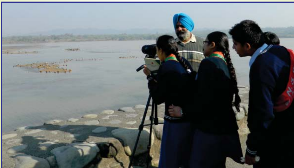
Bird watching at Sukhna Lake

“One crowded hour of glorious life is worth an age without a name”