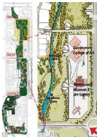
GOVERNMENT MUSEUM & ART GALLERY, SECTOR-10

Heritage Zone-XIII along V3s: Vidya Path, Udyan Path, Himalaya Marg, Sarovar Path, Sukhna Path, Chandi Marg Purv Marg, Vidya Path, Udhog Path and Dakshin Marg.