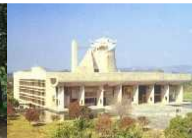
LEGISLATIVE ASSEMBLY, CAPITOL COMPLEX