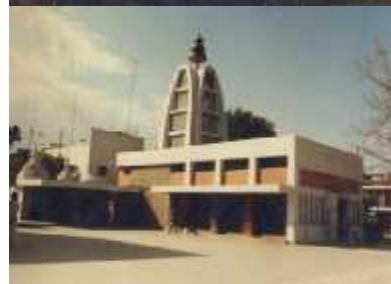
MANDIR, SECTOR 20