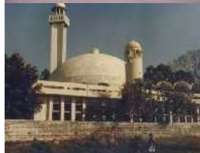
MOSQUE, SECTOR 20