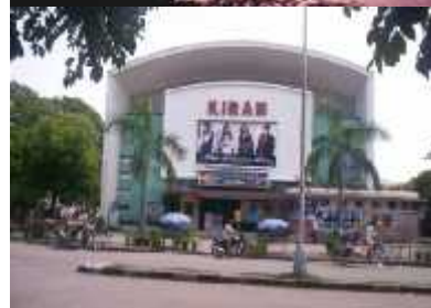
KIRAN CINEMA, SECTOR 22