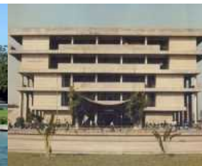
ADMINISTRATIVE COMPLEX PANJAB UNIVERSITY