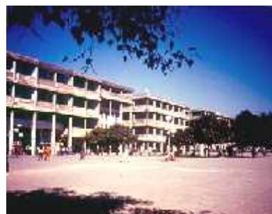
SHOP-CUM-OFFICES, CITY CENTRE, SECTOR 17

Church on V4, Sector 18 Mosque, Sector 20 Gurudwara on V5, Sector 22 Mandir on V4, Sector 23.