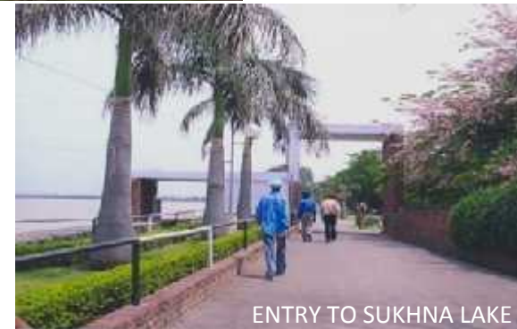
ENTRY TO SUKHNA LAKE