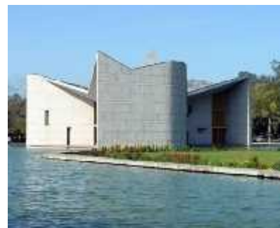
GANDHI BHAWAN , PANJAB UNIVERSITY