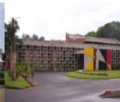
GOVERNMENT COLLEGE OF ARCHITECTURE ,SECTOR 12