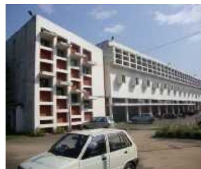
GOVERNMENT COLLEGE FOR GIRLS , SECTOR 11