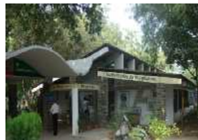
OLD ARCHITECTS OFFICE, SECTOR 19

Administrative Block, Punjab Engineering College, Sector 12