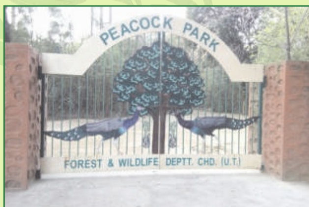
Peacock Park: a Paradise for our National Bird at Sector-39, Chandigarh

The Department of Forest & Wildlife, UT Chandigarh has developed a 5.7 Acre green area in Sector-39 as Peacock Park. This area is full of vegetation & a potential habitat for Pea fowls. The area has been fenced from all sides to provide a secluded place for resting of our National Bird. Adequate arrangement has been made for provision of water for the Pea Fowls inside the Park in the form of artificial ponds.