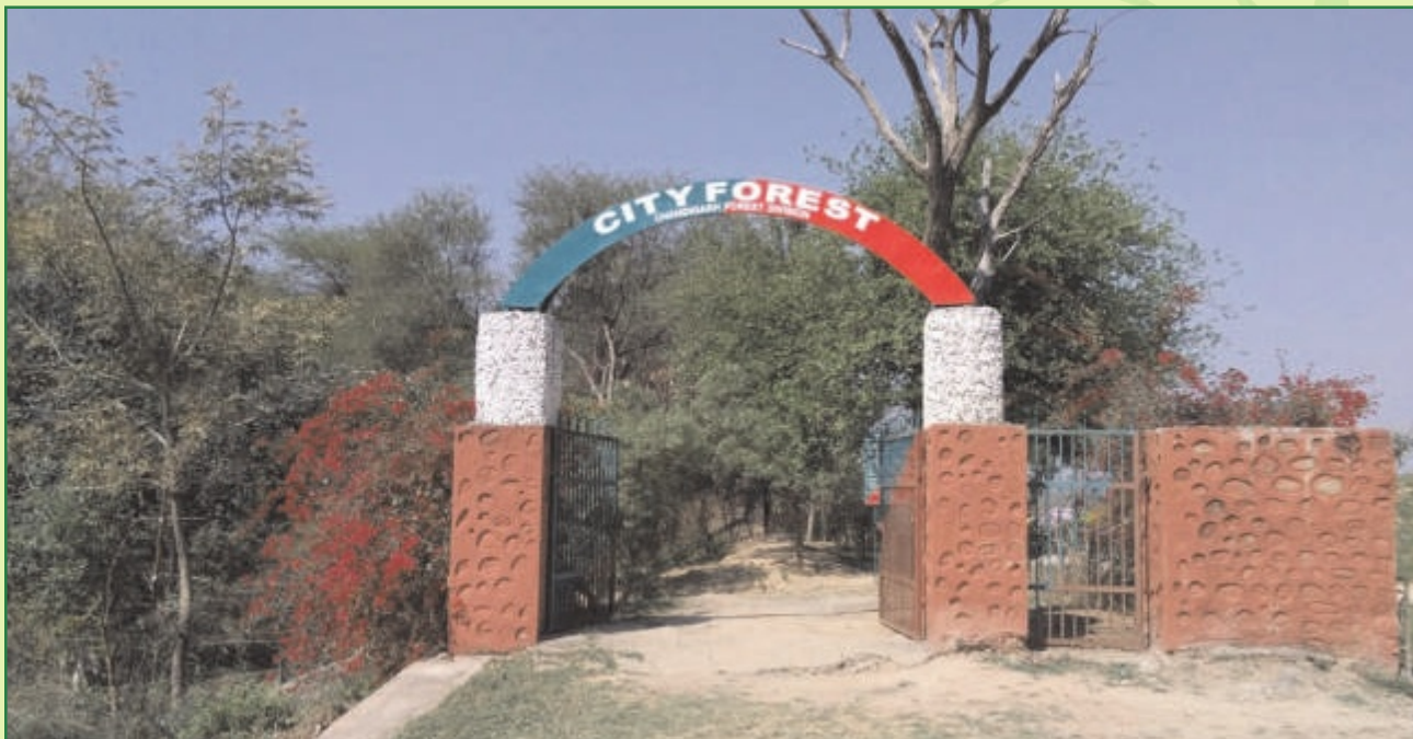
City Forest near I.T. Park, UT, Chandigarh

As a result of dedicated and sincere endeavor of the forest officials once a barren land, is now a Green Belt. More than 40 Species are growing in this area. This city forest is a paradise for morning & evening walkers & storehouse of fresh oxygen & relaxing place for the I.T. professionals.