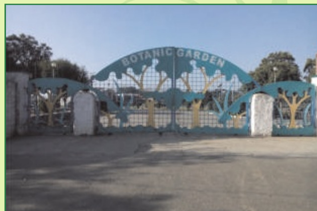
Botanical Garden near village Sarangpur

Chandigarh Administration has established a Botanical Garden near village Sarangpur. The Sprawling an area of 176 acres of verdant terrain, Chandigarh Botanical Garden with