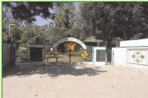
Butterfly Park, Sector 26, UT, Chandigarh