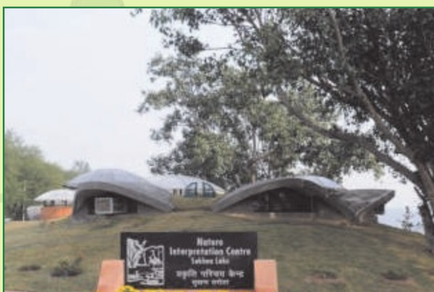
Nature Interpretation Center at Regulator End, Sukhna Lake