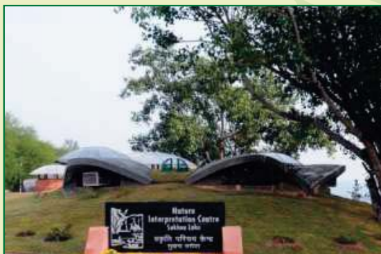
Nature Interpretation Center at Regulator End, Sukhna Lake