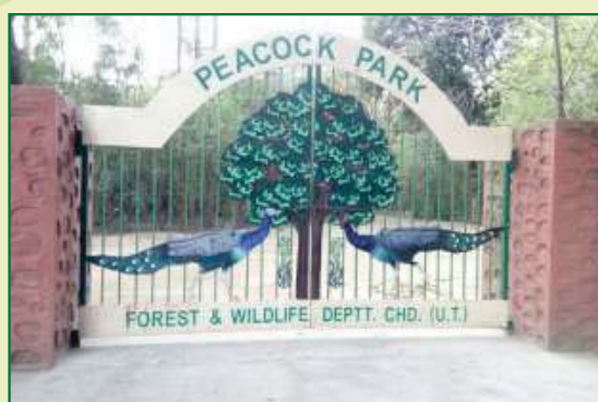
Peacock Park: a Paradise for our National Bird at Sector-39, Chandigarh

Department has developed a 5.7 Acre green area in Sector-39 as Peacock Park. This area is full of vegetation & a potential habitat for Pea fowls. The area has been fenced from all sides to provide a secluded place for resting of our National Bird. Adequate arrangement has been made for provision of water for the Pea Fowls inside the Park in the form of artificial ponds.