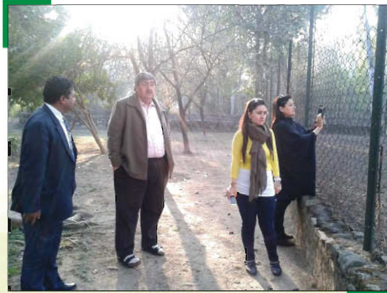
Mr. Justice Sanjay Kishan Kaul, Chief Justice, Hon'ble Punjab & Haryana High Court, during his visit to Sukhna Wildlife Sanctuary.