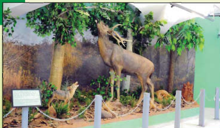
Life Size dioramas of Various Fauna of Sukhna Wildlife Sanctuary, at NIC, Regulator end, Sukhna Lake