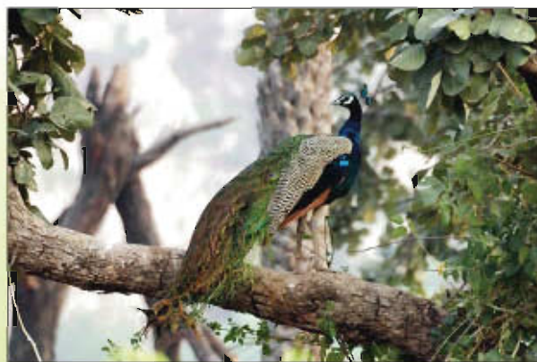
Peacock Park: a Paradise for our National Bird

Department has developed a 5.7 acre green area in Sector-39 as Peacock Park. This area is full of vegetation & a promising habitat for Pea fowls. The area has been fenced from all sides to provide a secluded place for resting of our National Bird. Adequate arrangement has been made for provision of water for the birds inside the Park in the form of artificial ponds. The objective of management in this park is to