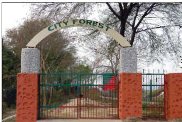
City Forest near I.T. Park, Chandigarh