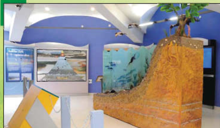
A Model Showing Cross Section of Sukhna Lake & Lake Ecosystem at NIC, Regulator end Sukhna Lake