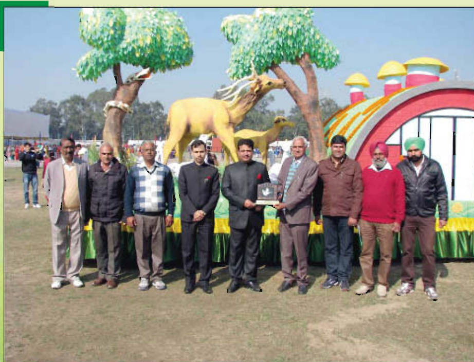
Prize winning Tableau of Department of Forests & Wildlife showcased on 26 th Jan. 2014 on the occasion of Republic Day-2014 in Parade Ground, Sector-17, Chandigarh.