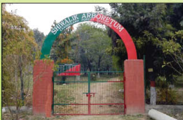
Shivalik Arboretum near Transport Chowk on Madhya Marg, Chandigarh

Forest Department Chandigarh has established an Arboretum near Transport Chowk, Sector-26 Chandigarh. Total area of Shivalik Arboretum is 11 Acres. After taking over the area in 1993-94, the Forest Department took up the challenging task of converting this barren land full with industrial waste into a green belt. Today this Shivalik Arboretum is full of prominent species found in Shivalik region and the citizen can enjoy their presence while walking along the natural trail.