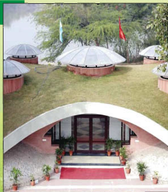
Nature Interpretation Center at Regulator End, Sukhna Lake