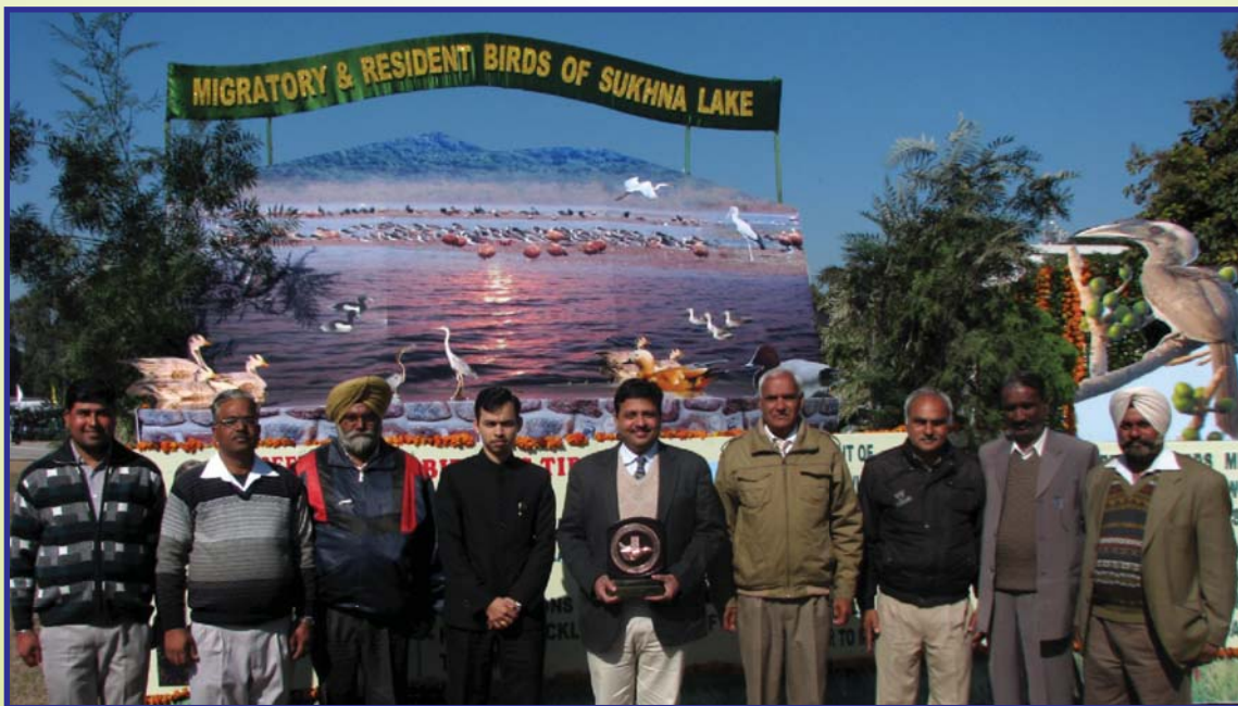
Prize winning Tableau of Department of Forests & Wildlife on the occasion of Republic Day-2013 in Parade Ground, Sector-17, Chandigarh.