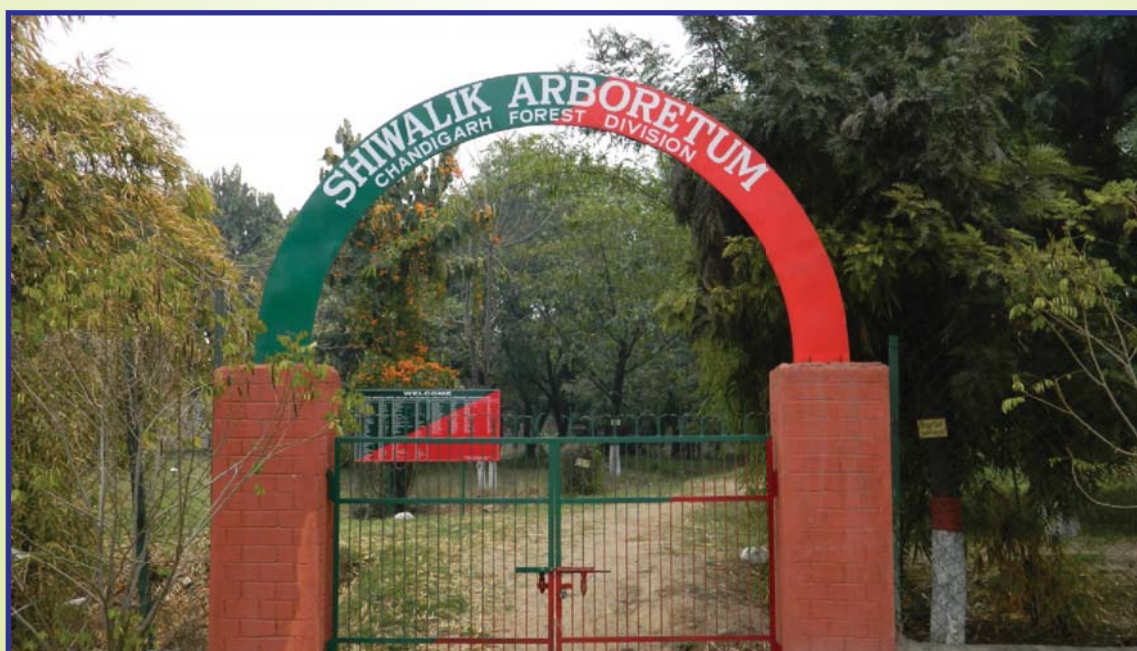
Shivalik Arboretum near Transport Chowk on Madhya Marg, Chandigarh

"Confidence is a thing that cannot be produced by compulsion"