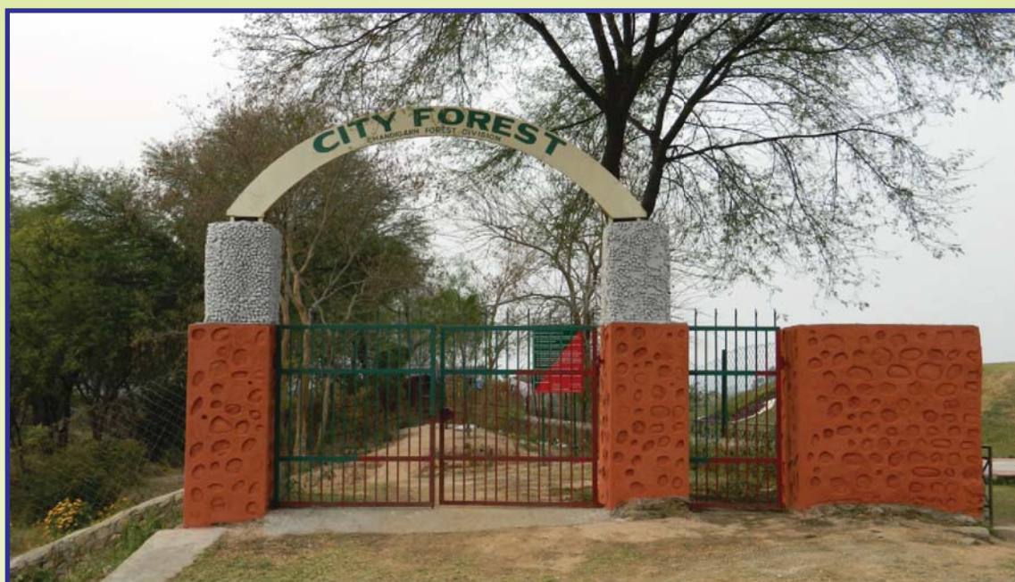
City Forest near I.T. Park, Chandigarh