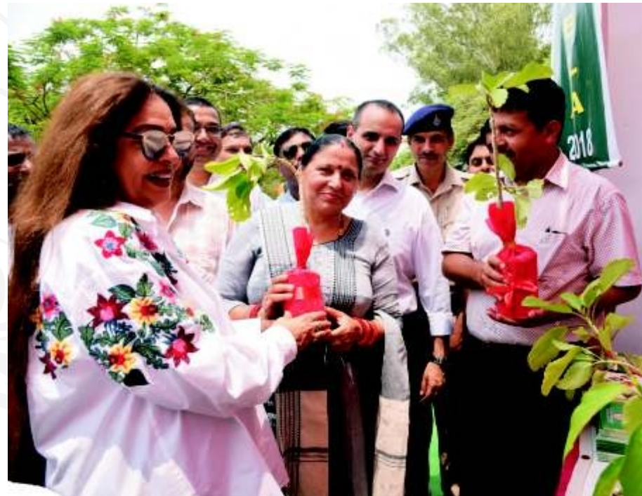
Smt. Kirron Kher, Hon'ble Member of Parliament, UT Chandigarh, distributing saplings during the occasion of 'Paudh Mela' on 2nd July, 2018

After inauguration of Paudhmela, Chief Guest also flagged off the 'Mahindra Scorpio Getaway' - a Pick-up Van vehicle for rescuing wild animals and bringing to health care facility or for release them in forest area. The vehicle was donated by Smt. Kirron Kher, Hon'ble Member of Parliament, UT, Chandigarh under MPLADS Scheme.