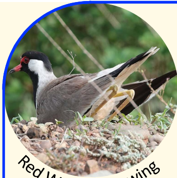
Red Wattled Lapwing