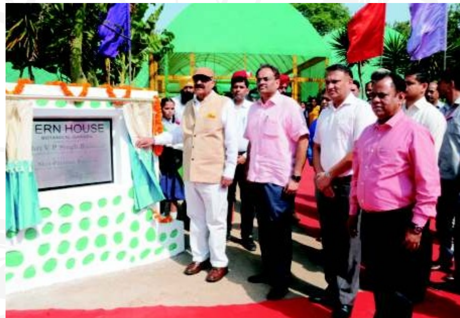
Shri V.P. Singh Badnore, Hon'ble Governor of Punjab & the Administrator, UT Chandigarh inaugurated a 'Fern House' at Botanical Garden