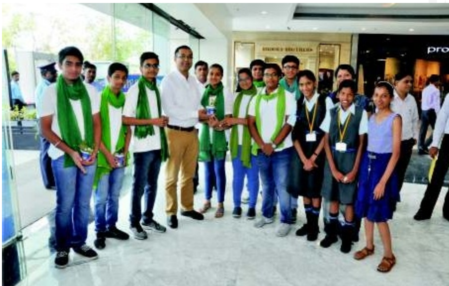
Distribution of Herbal Plants to students to promote Green Chandigarh on 5th June, 2018

On the occasion, Quiz Sessions were also held on the theme of Environment, Forests & Renewable Energy. Inter-School Poster making/ Slogan Writing Contests also marked the day. An Inter-School Short Play Contest was also organized on the occasion in nine School teams participated from St. Joseph's Sr. Sec. School, Sector 44-D, St. Stephen's