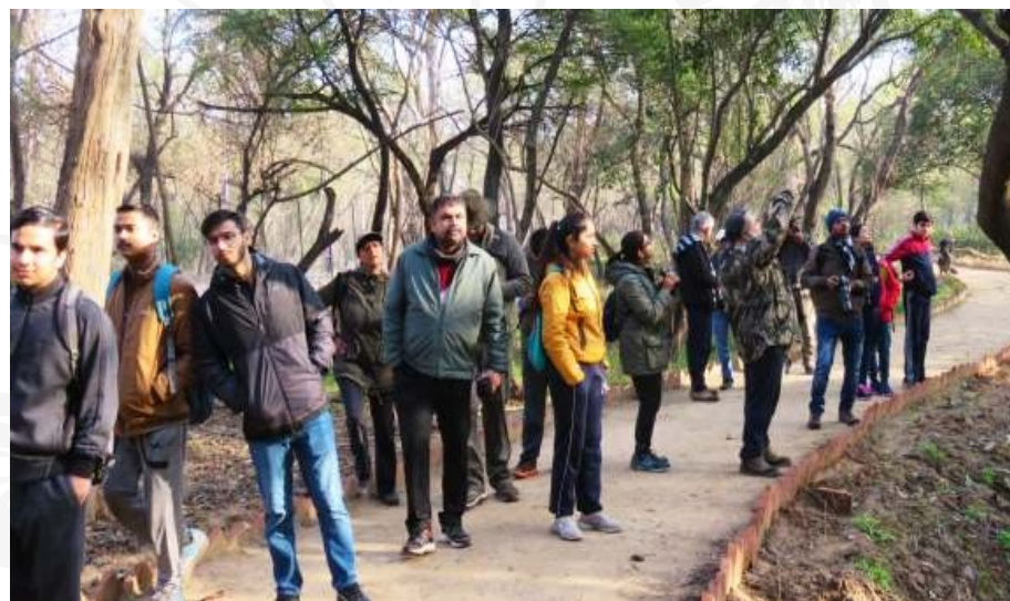
Bird walk in the City Forest