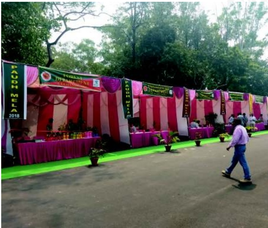
Stalls of Forest & Wildlife Department, Engineering Department, & Municipal Corporation during Paudhamela on 2nd July, 2018

A state level plantation programme was organised at parking place near Sukhna Lake Club which was attended by many dignitaries including - Smt. Kirron Kher, Hon'ble Member of Parliament, UT, Chandigarh. Three Stalls of Forest Department, Municipal Corporation, Horticulture wing of Engineering Department, Chandigarh were set up there. Forest Department distributed saplings free of cost whereas other departments are selling at nominal rate.