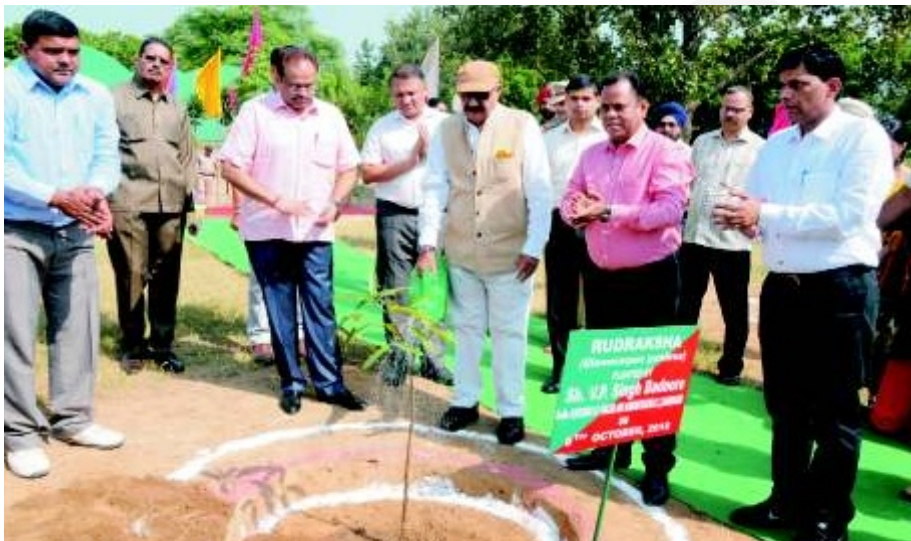
Planting sapling of 'Rudraksha' at Botanical Garden, Sarangpur, Chandigarh on 9th October, 2018