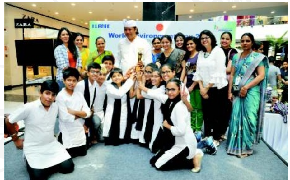
School Teachers and Students during the occasion of World Environment Day on 5th June, 2018