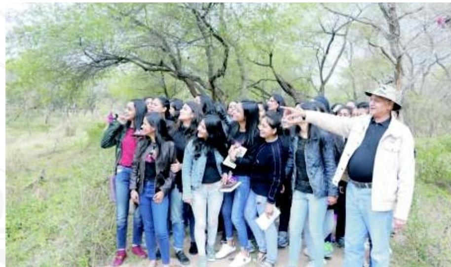
College Students during the Biodiversity Walk at City Forest, Chandigarh on 14th February, 2019

deer, wild boar, jungle cat, and even hyena. But generally, these animals steer clear of humans. The forest is a wild-life habitat, and the track circles it in a way so as not to disturb the animals.