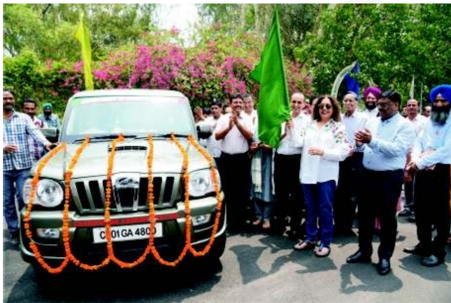
Smt. Kirron Kher, Hon'ble Member of Parliament, UT Chandigarh flagged off the 'Mahindra Scorpio Getaway' for rescuing wild animals