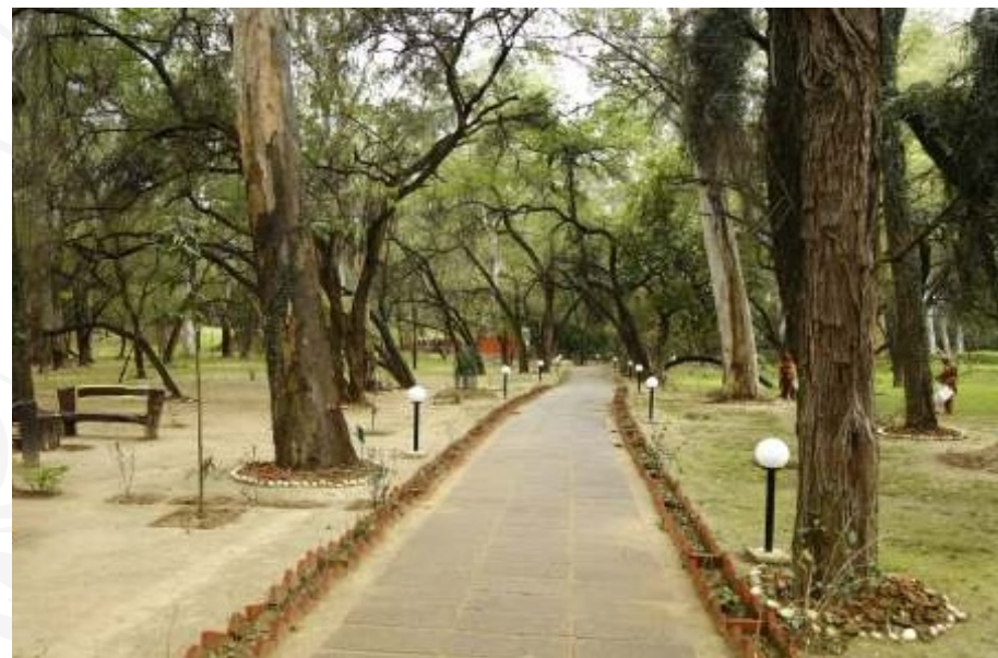
Walkways / Jogging Trails / Nature Trails

about the local flora and fauna installed along the tracks to sensitize the visitors about the environment. Natural looking wooden benches have been made by using dead and dry trees and placed along the tracks. This place is heaven for bird watchers due to the presence of more than 65 species of birds. Department also holds various events in this park with the collaboration of NGO's/Eco-clubs in which efforts have been made to create awareness about the conservation of natural resources amongst school/college students.