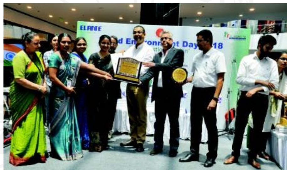
'Best Eco-Club Award' on occasion of 'World Environment Day' on 5th June, 2018 at Elante Mall, Chandigarh