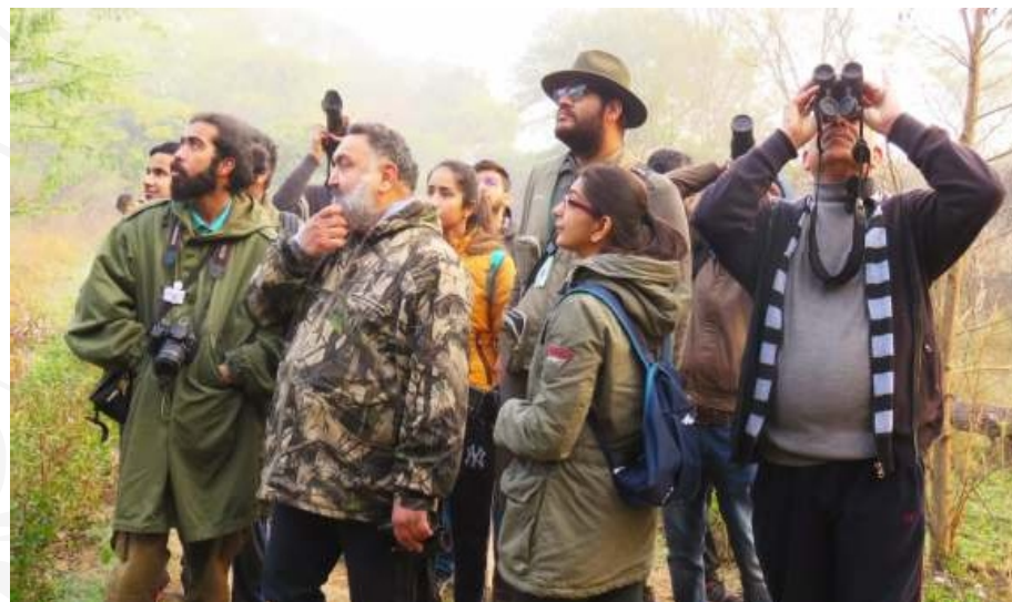
Visitors watching the birds during Bird Walk