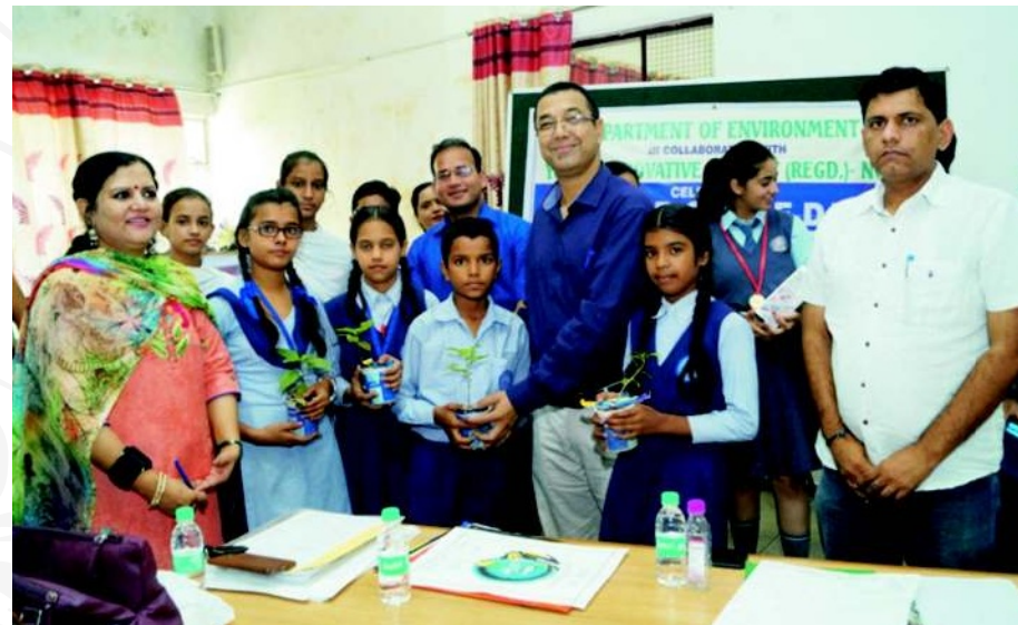
Sh. T.C. Nautiyal, IFS, Conservator of Forests, distributing saplings during the occasion of 'World Ozone Day'

1987. The aim of this is mainly intended to spread awareness about the depletion of the ozone Layer and search for solutions to preserve it.