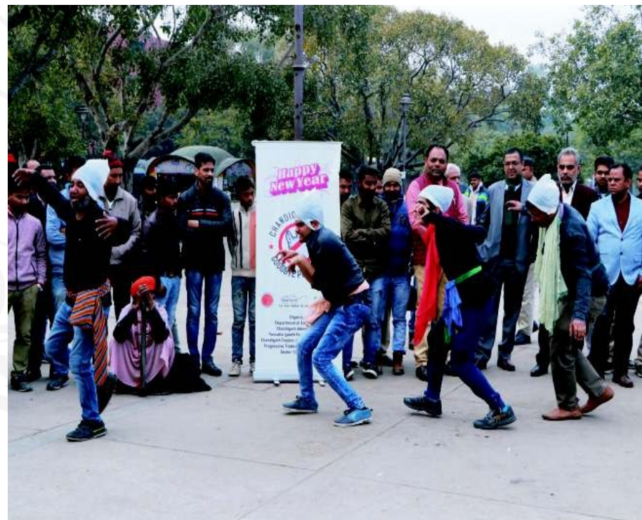
A drama played during 'Chandigarh Says Good-bye Poly Bags' on 1st January, 2019 at Sector 17 Plaza, Chandigarh