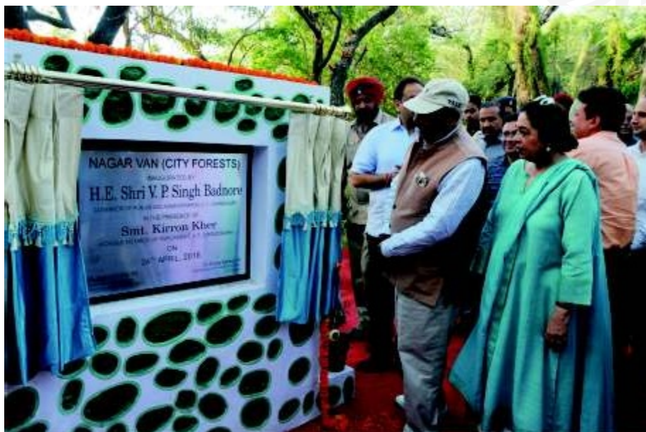
Shri V.P. Singh Badnore, the Hon'ble Governor of Punjab & the Administrator, UT, Chandigarh inaugurated Nagar Van (City Forests)

To attract the visitors many facilities like earthen tracks, shallow water bodies for avifauna, open air gym, kids play section, Meditation Hut, etc. has been provided. Interpretive signages showing information