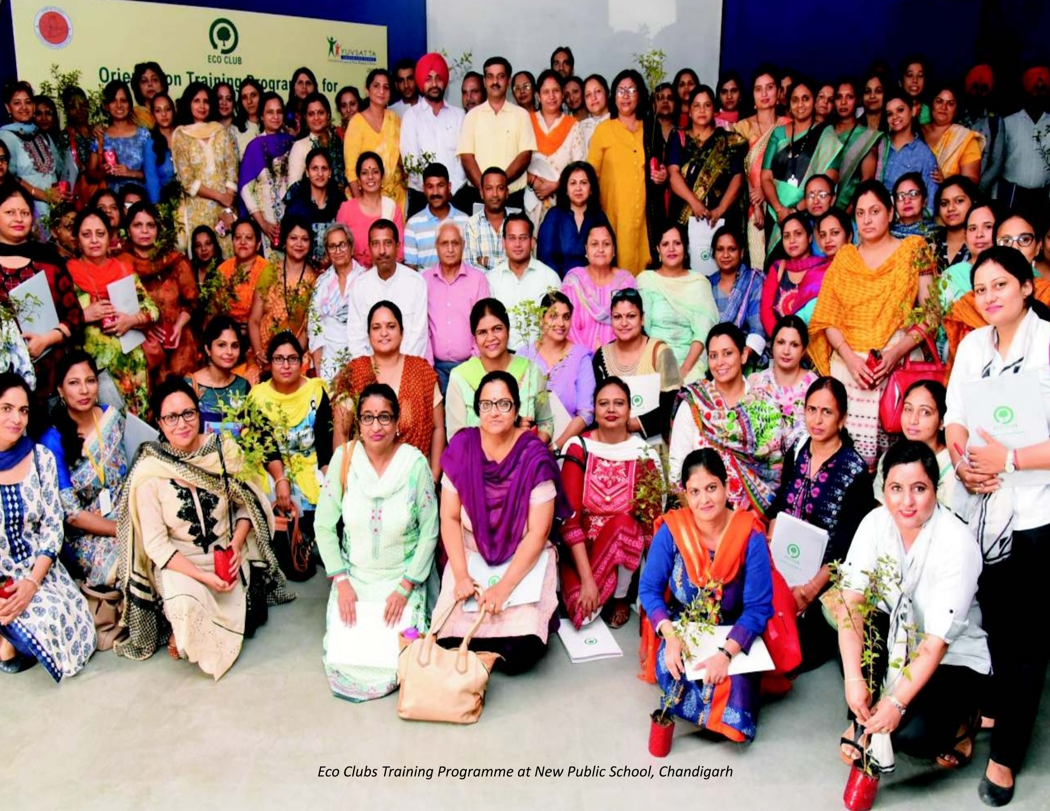
Eco Clubs Training Programme at New Public School, Chandigarh