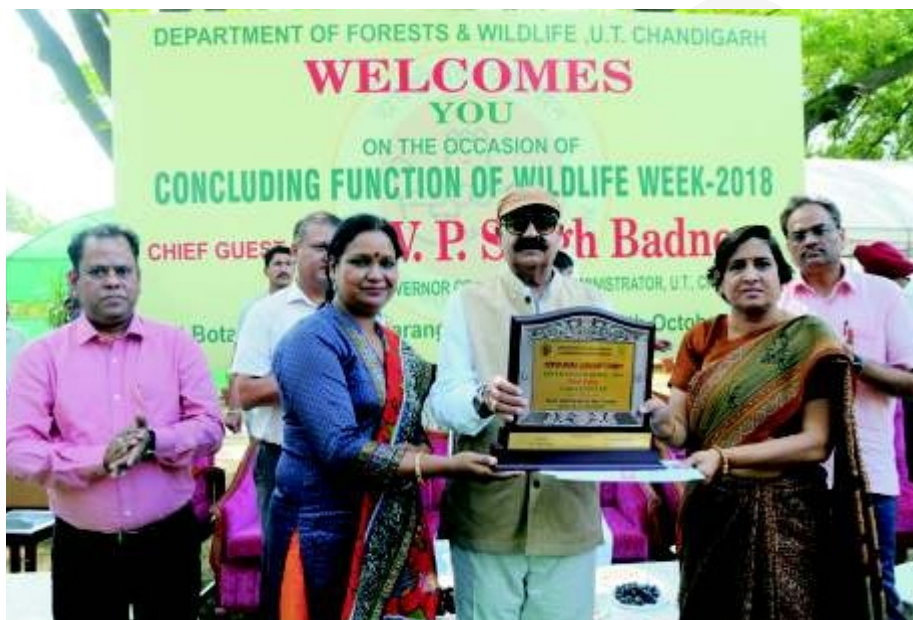
Hon'ble Governor of Punjab & the Administrator, UT Chandigarh distributed prize of 'Best Eco-Club Award'