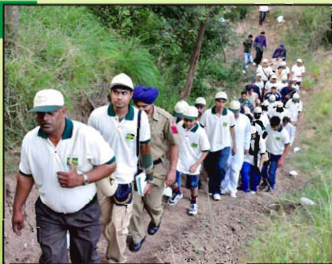
Participants of Nature & Wildlife Trek on the Trekking Route from Nepali to Kansal Log Hut Trek (7 km) on 2 nd October, 2013, during celebration of Wildlife Week 2013.