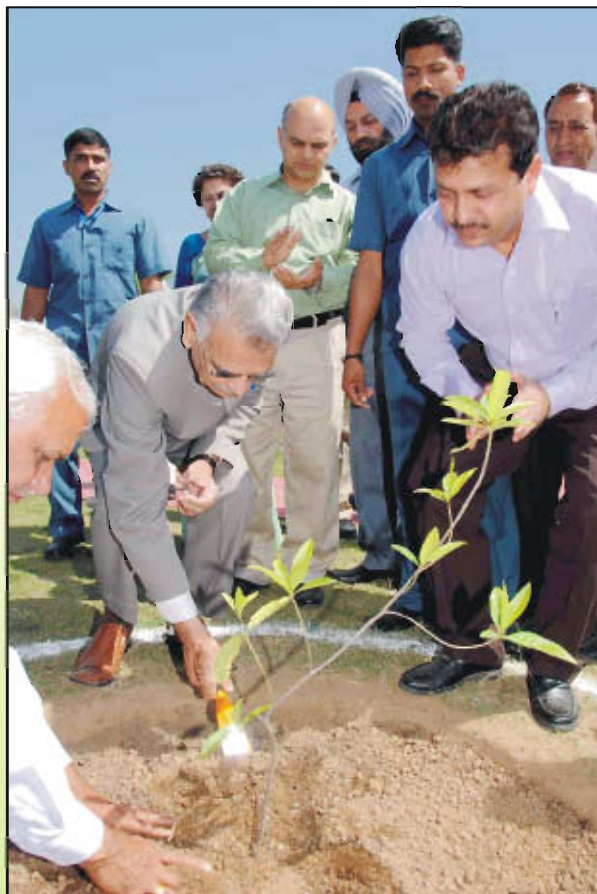
H.E. the Governor of Punjab & Administrator, UT Chandigarh Sh. Shiv Raj V Patil, planting a 'Rudraksha' Sapling on World Forestry Day on 21 st March, 2013