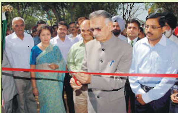
H.E. the Governor of Punjab & Administrator, UT Chandigarh, Sh. Shiv Raj V Patil, inaugurating the Energy Park at Botanical Garden, Sarangpur- Chandigarh on 21 st March, 2013

The World Forestry day was celebrated on 21 st March 2013 at Botanical Garden, Sarangpur-Chandigarh. H.E. the Governor of Punjab & Administrator, UT Chandigarh, Sh. Shiv Raj V Patil, was the Chief guest of the Occasion. On this day, The Chandigarh Energy Park was also Inaugurated by the chief guest. The Energy Park displays various non-conventional models of energy generation and thus gives a message of saving energy. Various stakeholders participated in this celebration.