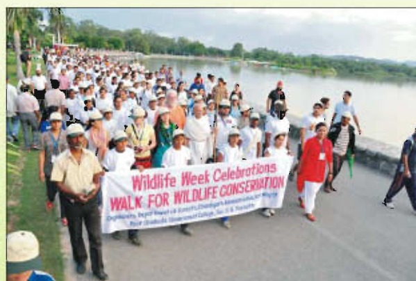
A walk for Wildlife Conservation organized on the occasion of Wildlife Week Celebration -2013 at Sukhna Lake on 2 nd October, 2013.