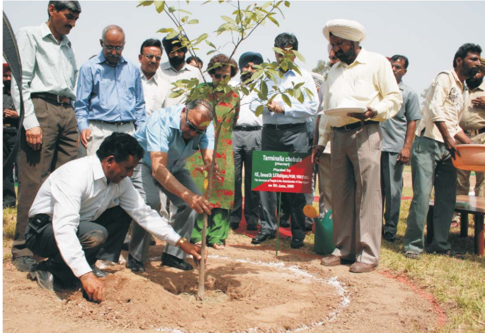
H.E. Gen (Retd.) S.F. Rodrigues, the then Governor Punjab & Administrator UT Chandigarh planting a sapling on World Environment Day 5 th June, 2009