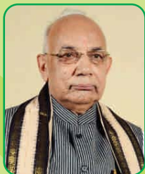
Prof. Kaptan Singh Solanki Governor of Punjab and Administrator Union Territory, Chandigarh