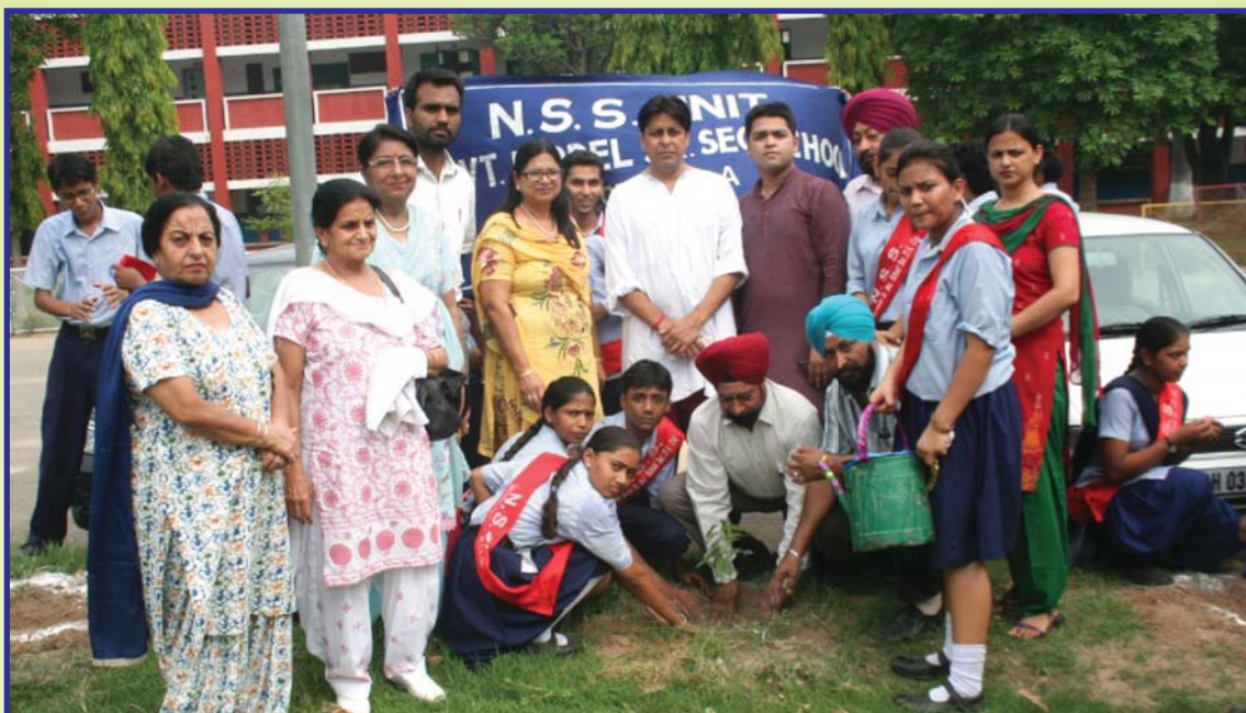
NGO members & NSS volunteers undertaking plantation activity in Govt. Model Sr. Sec. School, Sec 21 A, Chandigarh