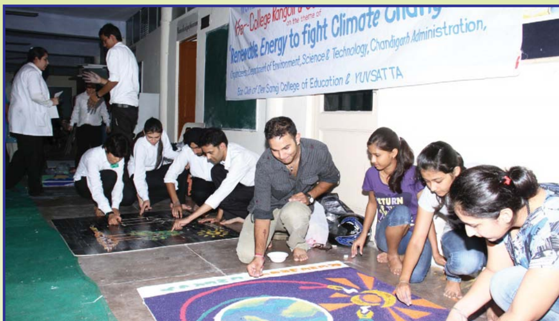
College students participating in Inter-College Rangoli & Collage Making contest on the theme 'Renewable Energy to fight Climate Change' at Dev Samaj College of Education, Chandigarh