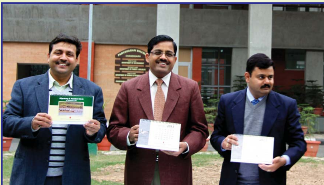
To spread awareness among masses a table calendar 2013 with a theme Migratory & resident Birds of Sukhna Lake was released.