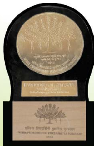
'Indira Priyadarshini Vriksha Mitra [IPVM] Award-2010'