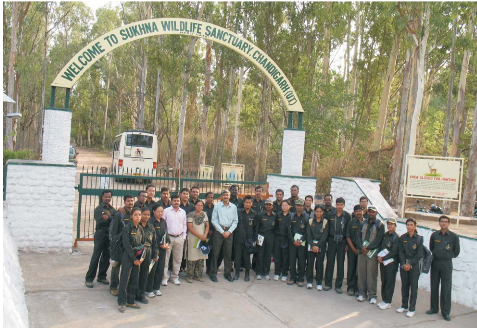
Indian Forest Service (IFS) Probationers on study tour to Sukhna Wildlife Sanctuary to study the soil & moisture conservation works in the catchment area.