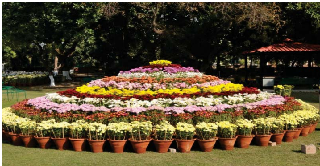
Varieties of flowers at Annual Chrysanthemum Show at Terraced Garden, Sec.33 on 10.12.2010

Chrysanthemum Show is being held every year in the Terraced Garden in the month of December in which Government, semi Government, private institutions and individual growers take part. This show is appreciated by one and all.