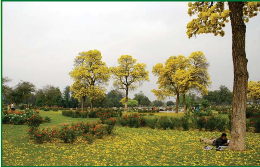
Rose Garden, Sector 16, Chandigarh