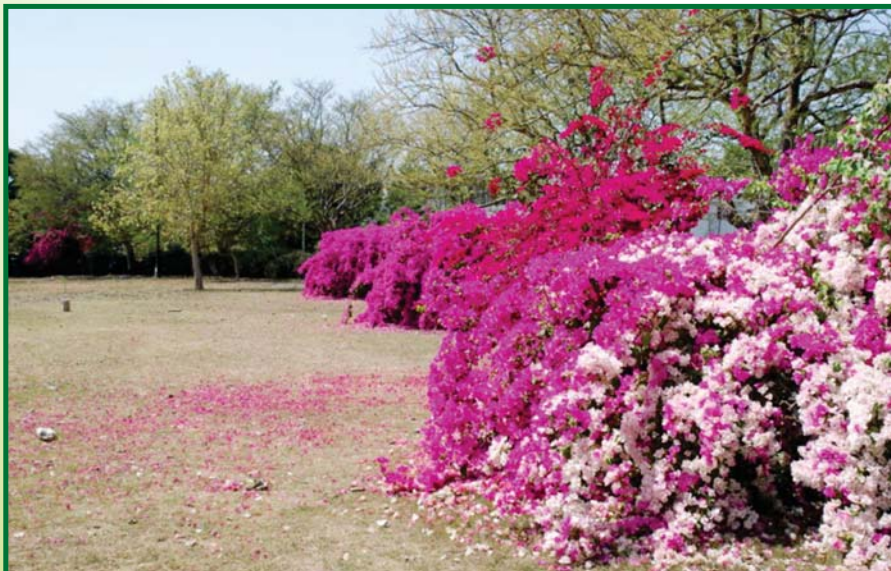
Bougainvillea Garden, Sector 3, Chandigarh