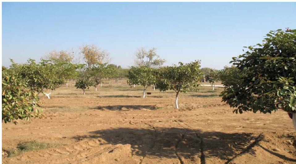
Herbal Garden at Botanical Garden, Sarangpur village

To promote awareness & education about Ayurveda & Indian System of Medicines, Department is assisting & advising AYUSH Department, schools, colleges & University to establish small Herbal gardens. With the active involvement of Schools and Colleges, Herbal Gardens in 41 schools, 5 Colleges & one in Panjab University have been established. Three Herbal gardens have been developed in Ayurveda Dispensaries. During 2011-12, more herbal gardens will be added in the city