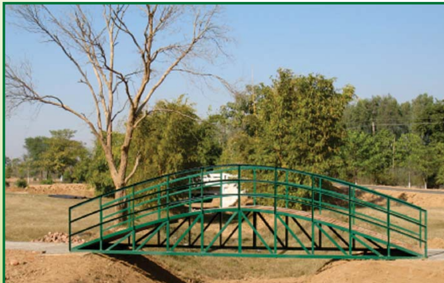
Foot Bridge, Botanical Garden, Sarangpur