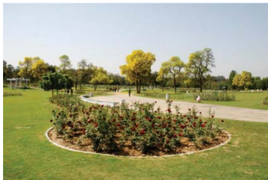
Rose Garden, Sector 16, Chandigarh