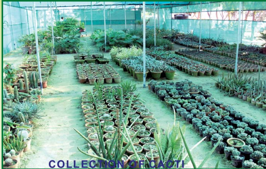
COLLECTION OF CACTI