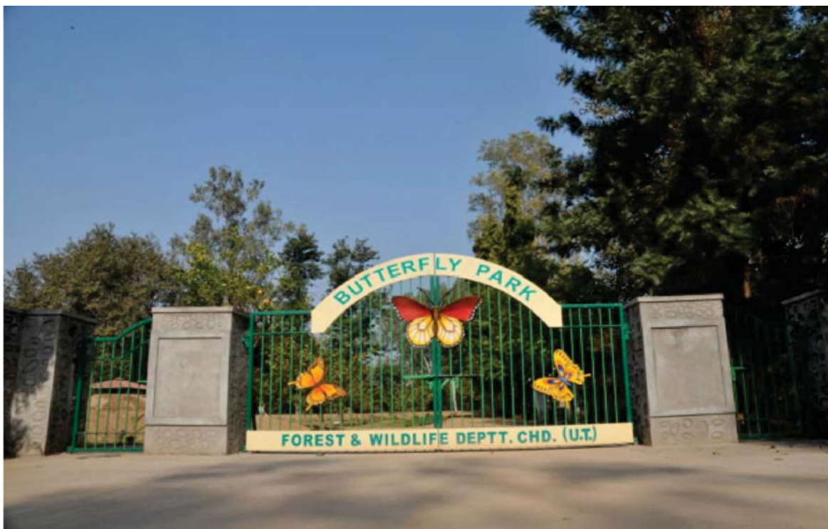
Butterfly Park, Sector -26, Chandigarh

This site will also house Museum/ Interpretation Centre on Butterfly, Visitors shed etc.