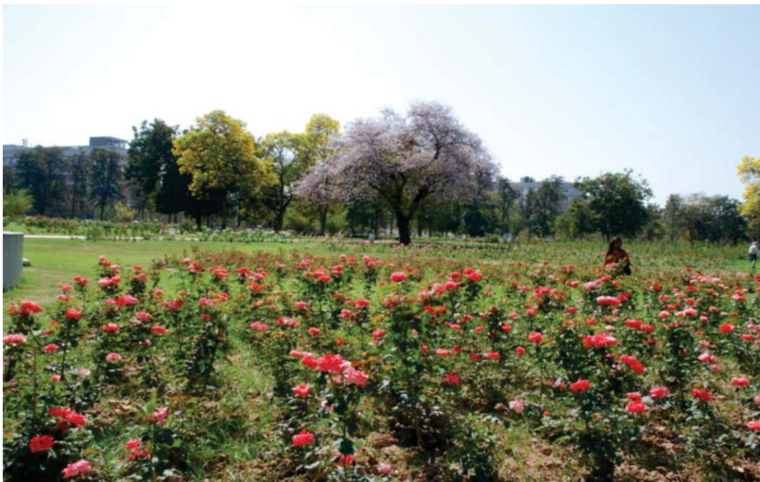
Rose Garden, Sector 16, Chandigarh

Municipal Corporation is also maintaining a Plant Nursery in Sector 29-B in which shade giving and ornamental trees are propagated which cater the needs of the plantation in the city as well as these are sold to the public. A small Rose Plant Nursery is being maintained in which varieties of Roses are propagated and sold to the public.