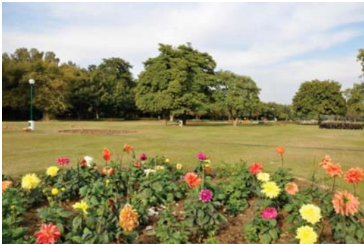
Rose Garden, Sector 16, Chandigarh

During 2011-12, Horticulture Division of Engineering Department will be planting 8925 no. of trees, 8730 nos. of shrubs/ creepers & 21500 no. of other kinds, along different roads, parks and Leisure valley etc. Hardy, shade giving and pollution abating species like Arjun, Harar, Bahera, Ficus retusa, Moulisari will be planted along road sides and gardens. At all the entry points of the roads to Chandigarh and at various vintage points in gardens, green belts & parks, the Department will plant flowering trees in group to give mass effect to the flowers in bloom. Different group of trees will be in flowering during different season. This will add to the aesthetics of the area. Details are available at Annexure-III .