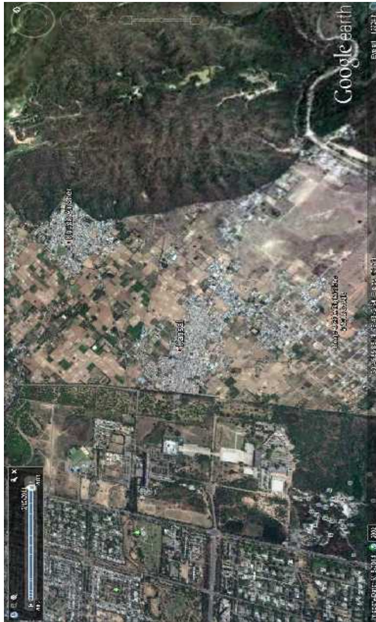
THE CAPITOL COMPLEX AND THE AREA TO ITS NORTH (GOOGLE MAP)