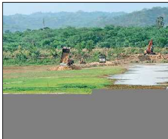
PROBLEM OF SILTATION IN THE LAKE