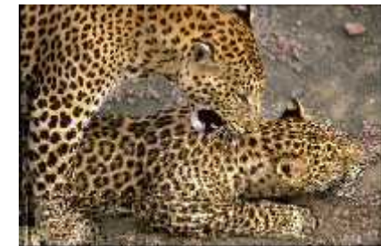
SUKHNA WILDLIFE SANCTUARY