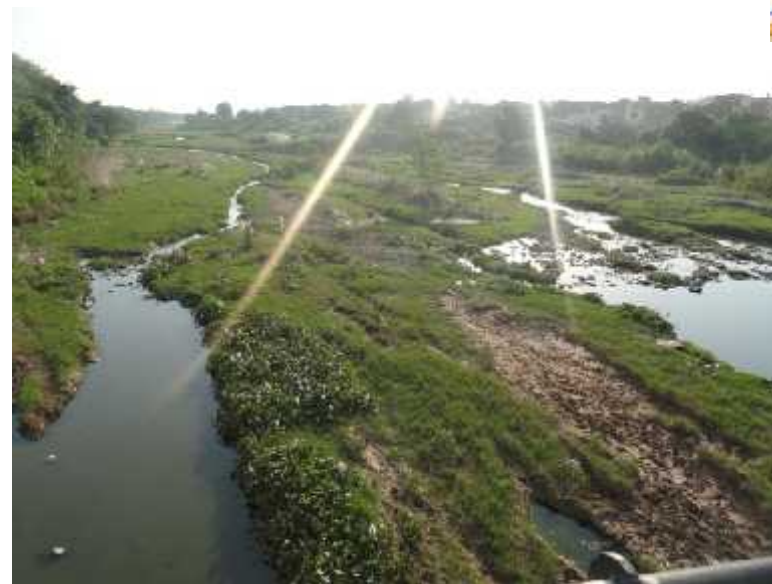
POLLUTION INTO PATIALI KI RAO