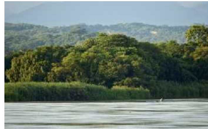
FOREST AREAS IN CHANDIGARH