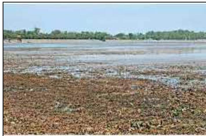
CONCERN - THE DRYING UP OF THE SUKHNA LAKE