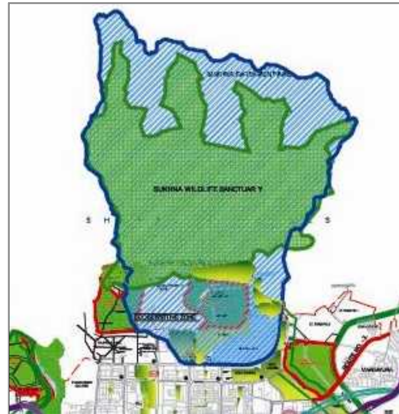
LOCATION OF SUKHNA WILD LIFE SANCTUARY ON THE NORTH OF CHANDIGARH