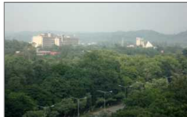
THE FOREST & TREE COVER OF CHANDIGARH

The forest & tree cover of the UT of Chandigarh has increased consistently over the last decade and as per the State of Forest Report 2011, the total green cover (forest cover + tree cover) of UT, Chandigarh is placed at 23.65% of its geographical area. Recognizing these efforts, the Union Territory of Chandigarh was awarded the 'Indira Priyadarshini Vriksha Mitra (IPVM) Award-2010' under the UT category.