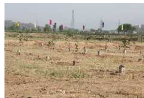
THEMATIC PLANTATION IN THE NEWLY ACQUIRED LAND FOR THE WILD LIFE AT VILLAGE KAIMBWALA