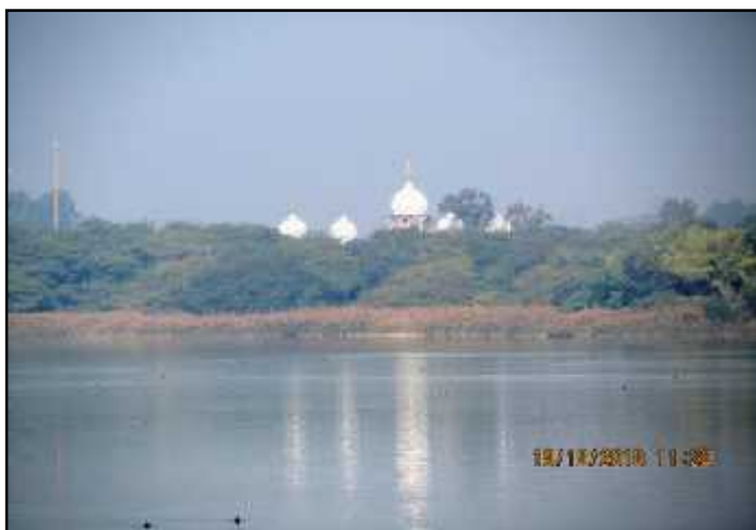
EMERGING THREATS TO THE NATURAL SETTING. STRICT MONITORING OF DEVELOPMENTS ON THE NORTH IS ESSENTIAL.