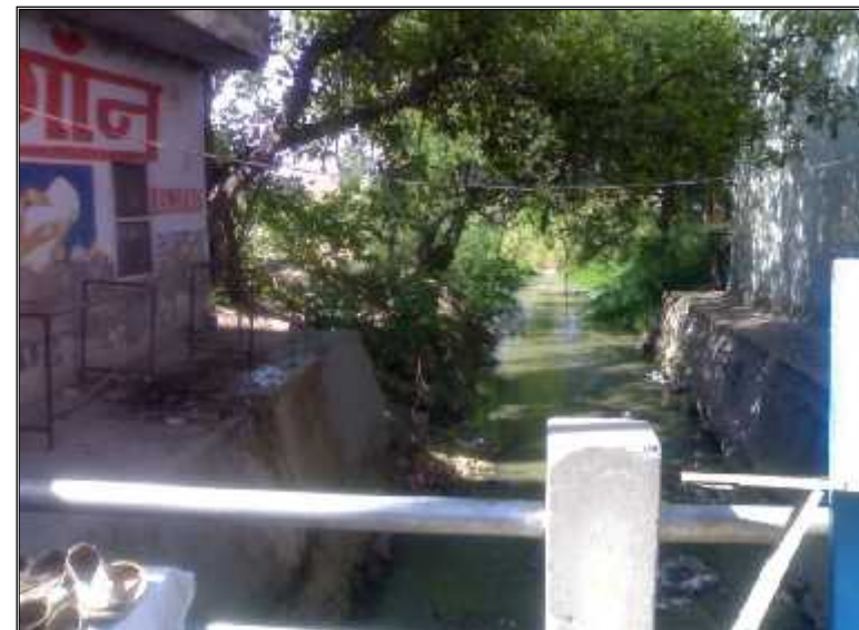
ENCROACHMENT INTO THE NATURAL RIVULETS