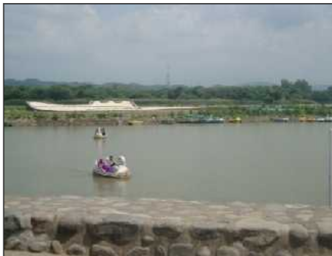
SUKHNA LAKE AND THE FORESTS IN THE BACKDROP