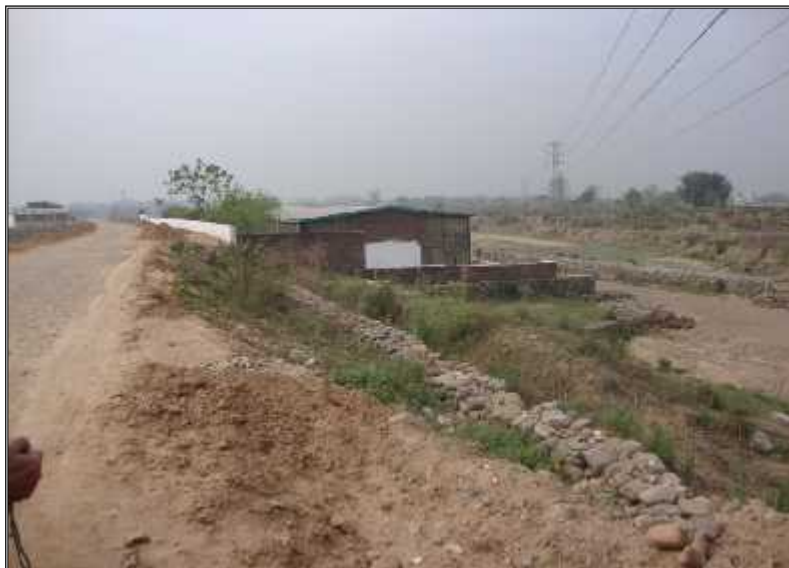
ENCROACHMENTS WITHIN THE NATURAL RIVULETS