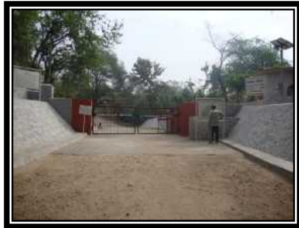
Entrance to the Sukhna Wildlife Sanctuary