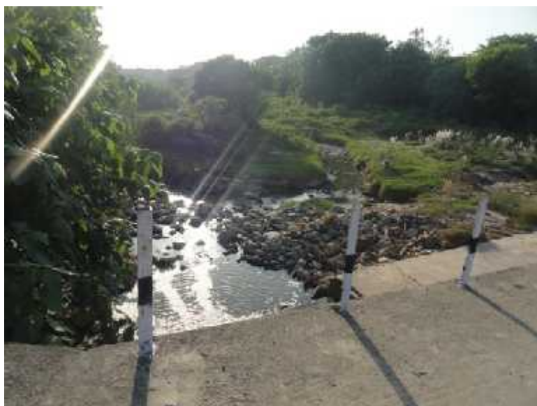
POLLUTION INTO PATIALI KI RAO