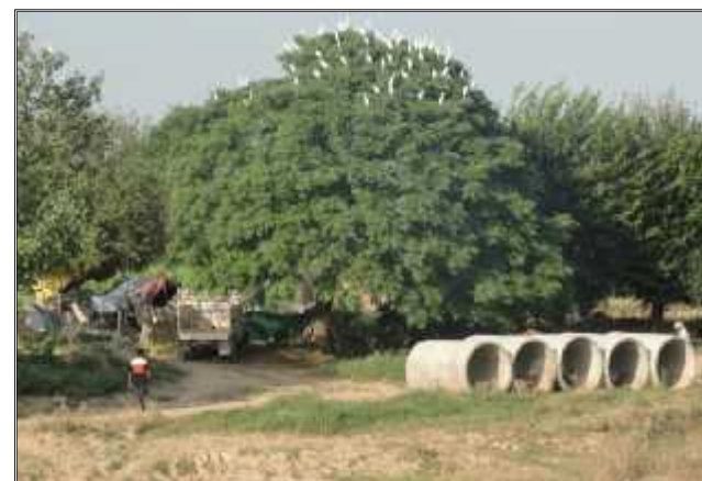
PATIALI KI RAO