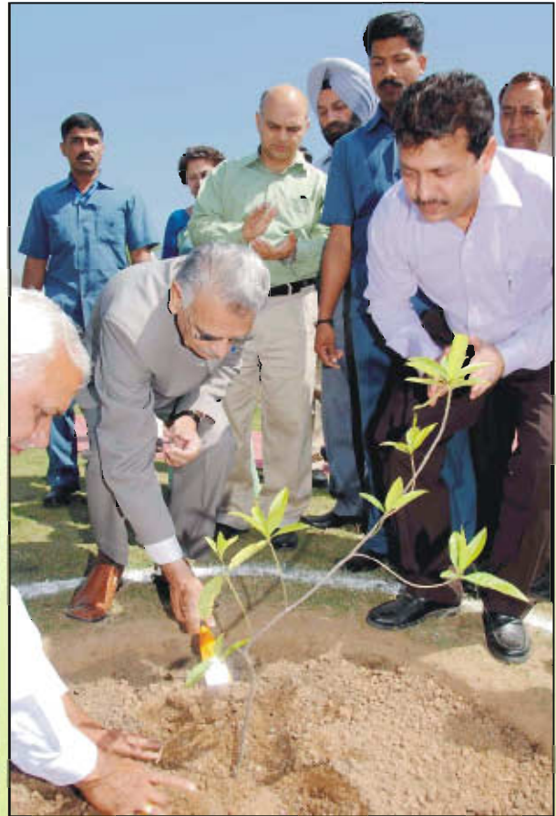
H.E. the Governor of Punjab & Administrator, UT Chandigarh Sh. Shiv Raj V Patil, planting a 'Rudraksha' Sapling on World Forestry Day on 21 st March, 2013