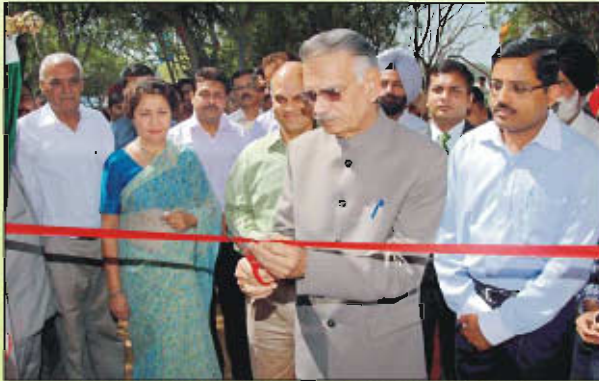
H.E. the Governor of Punjab & Administrator, UT Chandigarh, Sh. Shiv Raj V Patil, inaugurating the Energy Park at Botanical Garden, Sarangpur- Chandigarh on 21 st March, 2013

The World Forestry day was celebrated on 21 st March 2013 at Botanical Garden, Sarangpur-Chandigarh. H.E. the Governor of Punjab & Administrator, UT Chandigarh, Sh. Shiv Raj V Patil, was the Chief guest of the Occasion. On this day, The Chandigarh Energy Park was also Inaugurated by the chief guest. The Energy Park displays various non-conventional models of energy generation and thus gives a message of saving energy. Various stakeholders participated in this celebration.