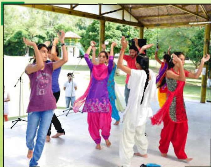
One Act Play Bin Pani Sab Suna by Shuruat Samity, Karnal, on 2 nd October, 2013, during celebration of Wildlife Week 2013 at Kansal Log Hut.