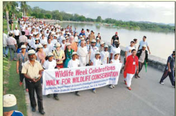
A walk for Wildlife Conservation organized on the occasion of Wildlife Week Celebration -2013 at Sukhna Lake on 2 nd October, 2013.