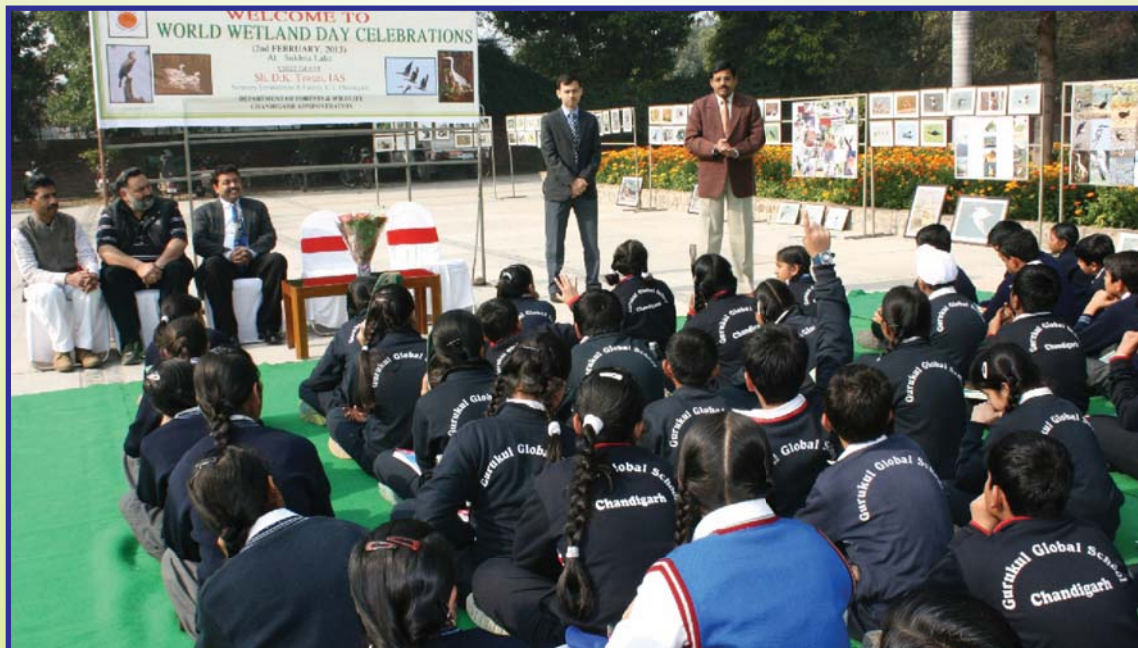
Display of Photo frames on Migratory & Resident birds for generating awareness among masses, during Celebration of World Wetland Day on 2 nd February, 2013 at Sukhna Lake.

“Character is property. It is the noblest of possession”