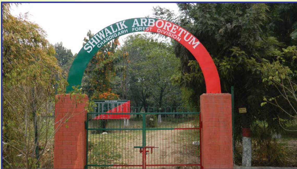
Shivalik Arboretum near Transport Chowk on Madhya Marg, Chandigarh

“Confidence is a thing that cannot be produced by compulsion”