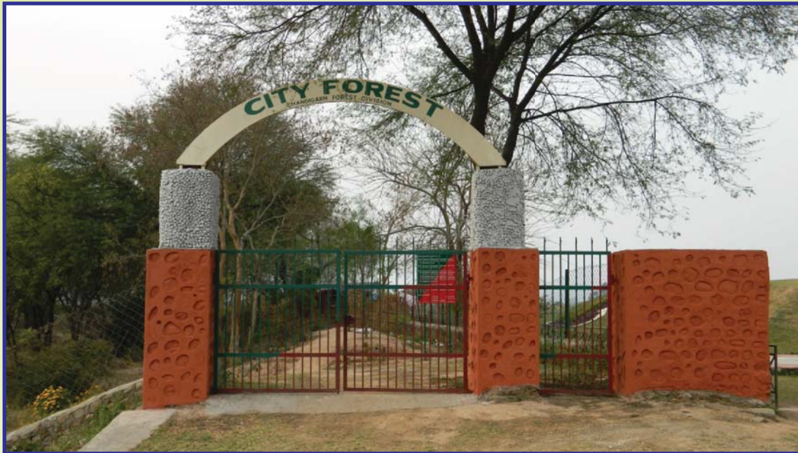
City Forest near I.T. Park, Chandigarh