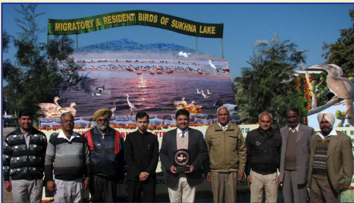
Prize winning Tableau of Department of Forests & Wildlife on the occasion of Republic Day-2013 in Parade Ground, Sector-17, Chandigarh.