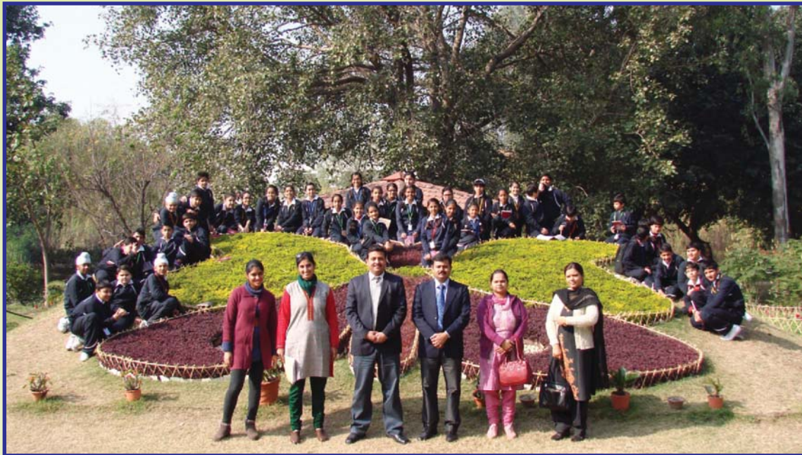
Excursion trips of School Students organized by Forest Department in co-ordination with DEEKSHA-NGO in Butterfly Park.