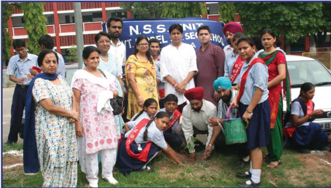
NGO members & NSS volunteers undertaking plantation activity in Govt. Model Sr. Sec. School, Sec 21 A, Chandigarh