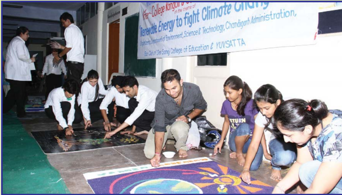
College students participating in Inter-College Rangoli & Collage Making contest on the theme 'Renewable Energy to fight Climate Change' at Dev Samaj College of Education, Chandigarh